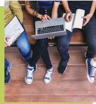
Technology Infused Learning