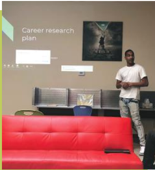
Innovative Academic Programming

THE MENTA GROUP® NEVER GIVES UP ON EDUCATING A CHILD!