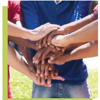
Citizenship, College & Career Ready Students

Who we are: Our vision is to provide innovative solutions to critical problems in education and human services. We partner with parents and school districts making success a reality for high-risk and special education youth.