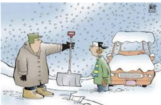
SORRY, SON... THERE'S NO APP FOR THAT